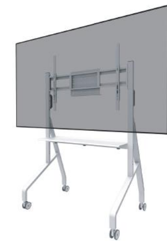
FL50-525WH1 Screen size: 55-86" Max. capacity: 76 kg Height: 106-136 cm