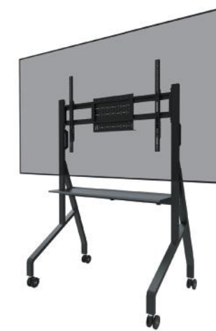
FL50-525BL1 Screen size: 55-86" Max. capacity: 76 kg Height: 106-136 cm