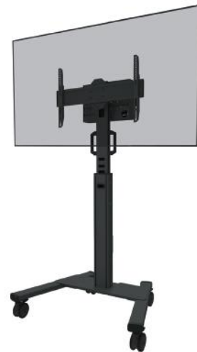
FL50S-825BL1 Screen size: 37-75" Max. capacity: 70 kg Height: 104-157 cm