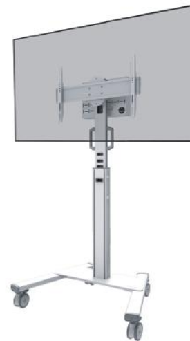
FL50S-825WH1 Screen size: 37-75" Max. capacity: 70 kg Height: 104-157 cm

Accessories: AFLS-825BL1/WH1: Cam & multimedia kit incl. Logitech adapter AV1-875BL: Cam & multimedia kit incl. Bose Professional adapter ABL-875: Caster brake lock